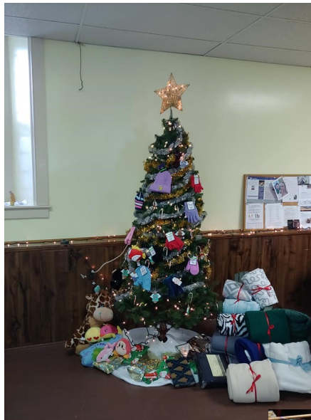
Christmas Day Dinner