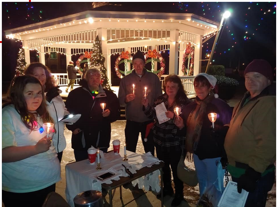
Candlelight Christmas Eve service at the Town Common